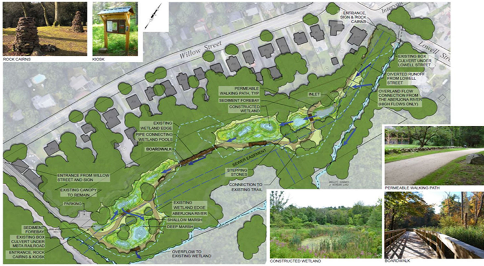
CONCEPTUAL STORMWATER TREATMENT SYSTEM READING, MA APRIL, 2021