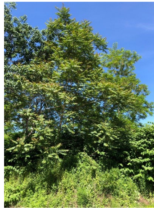
Tree of Heaven