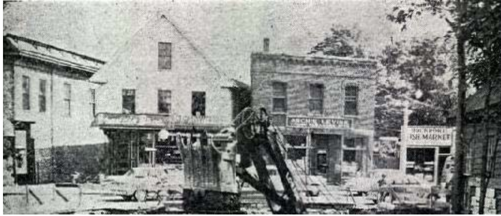
Building at 175 Haven Street is brick, two-story structure at right center (Archie Levine over doorway). Note originally there were three windows on second story.