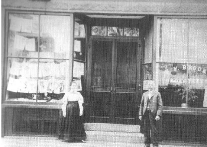
Undated (between 1894 and 1902) photo of 175 Haven Street storefront during occupation by E.F. Brooks.