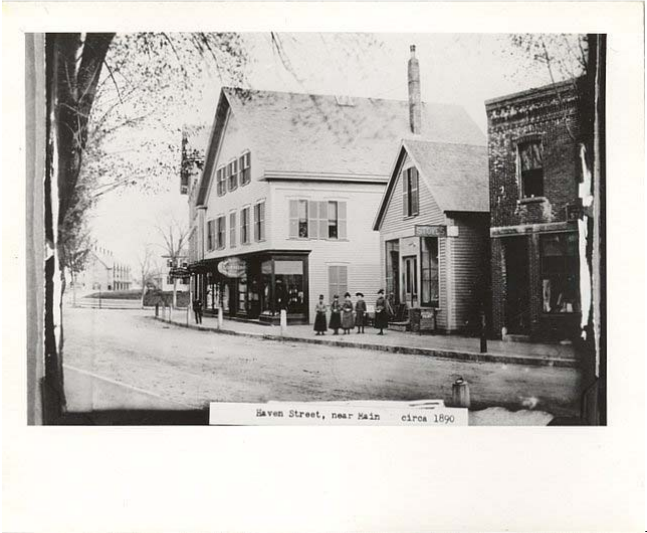
Haven Street looking east toward Main – part of 175 Haven is visible at extreme right.