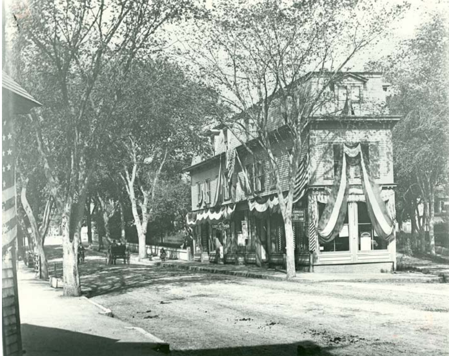
1894 view of the Flat Iron Building, looking east