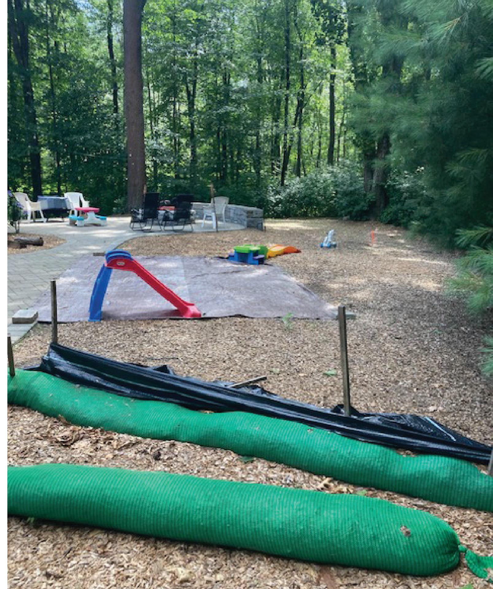
Landscaping in Rear yard