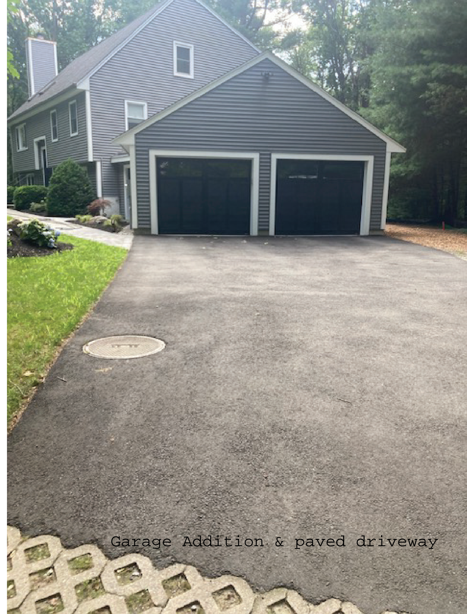
Garage Addition & paved driveway