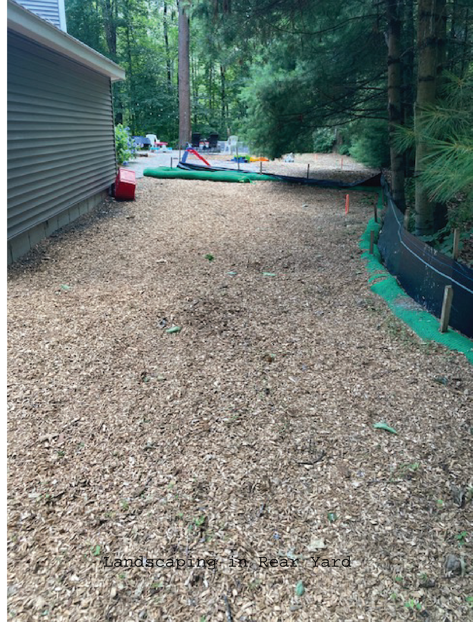
Landscaping in Rear Yard