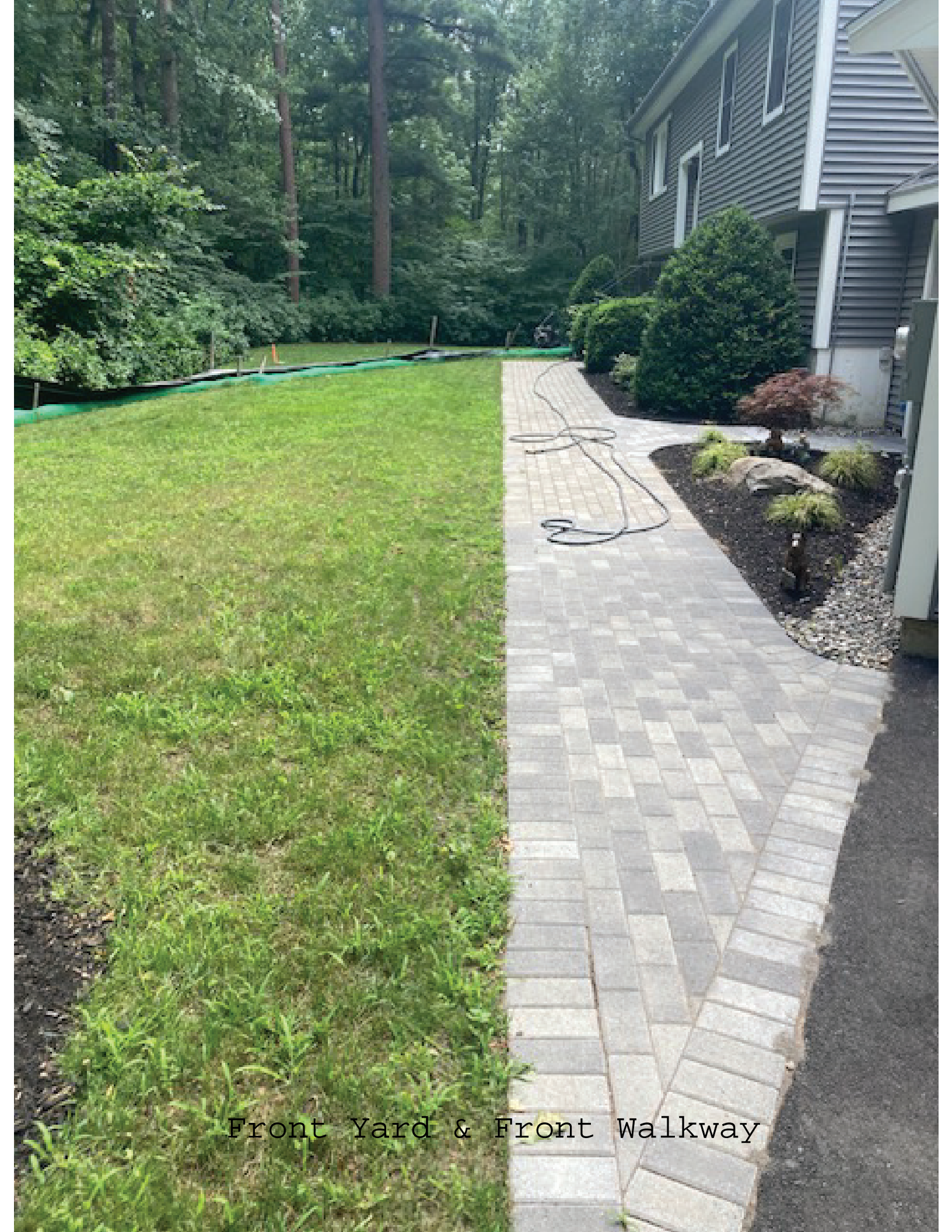
Front Yard & Front Walkway