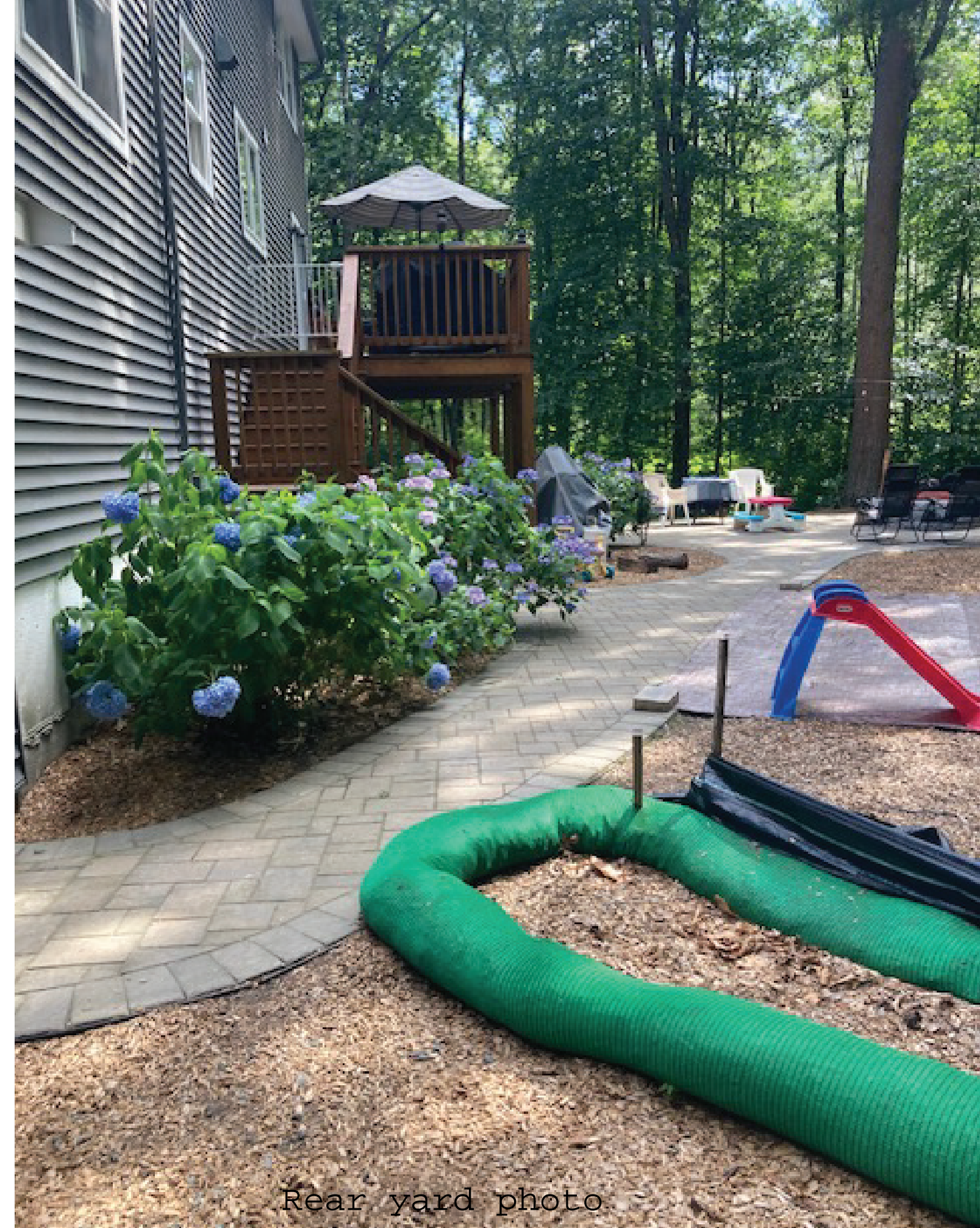
Rear yard photo.