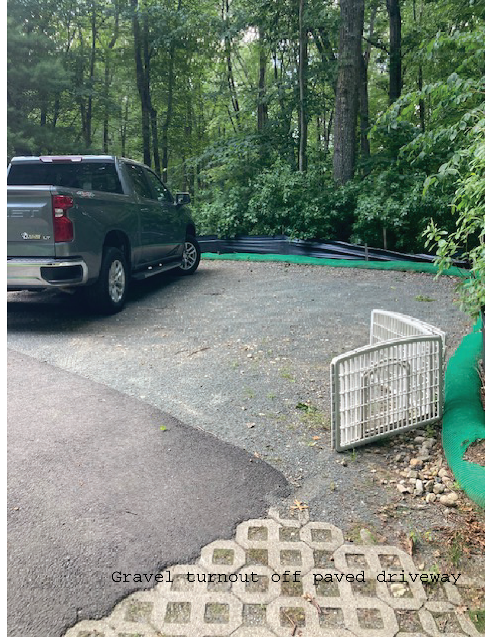
Gravel turnout off paved driveway