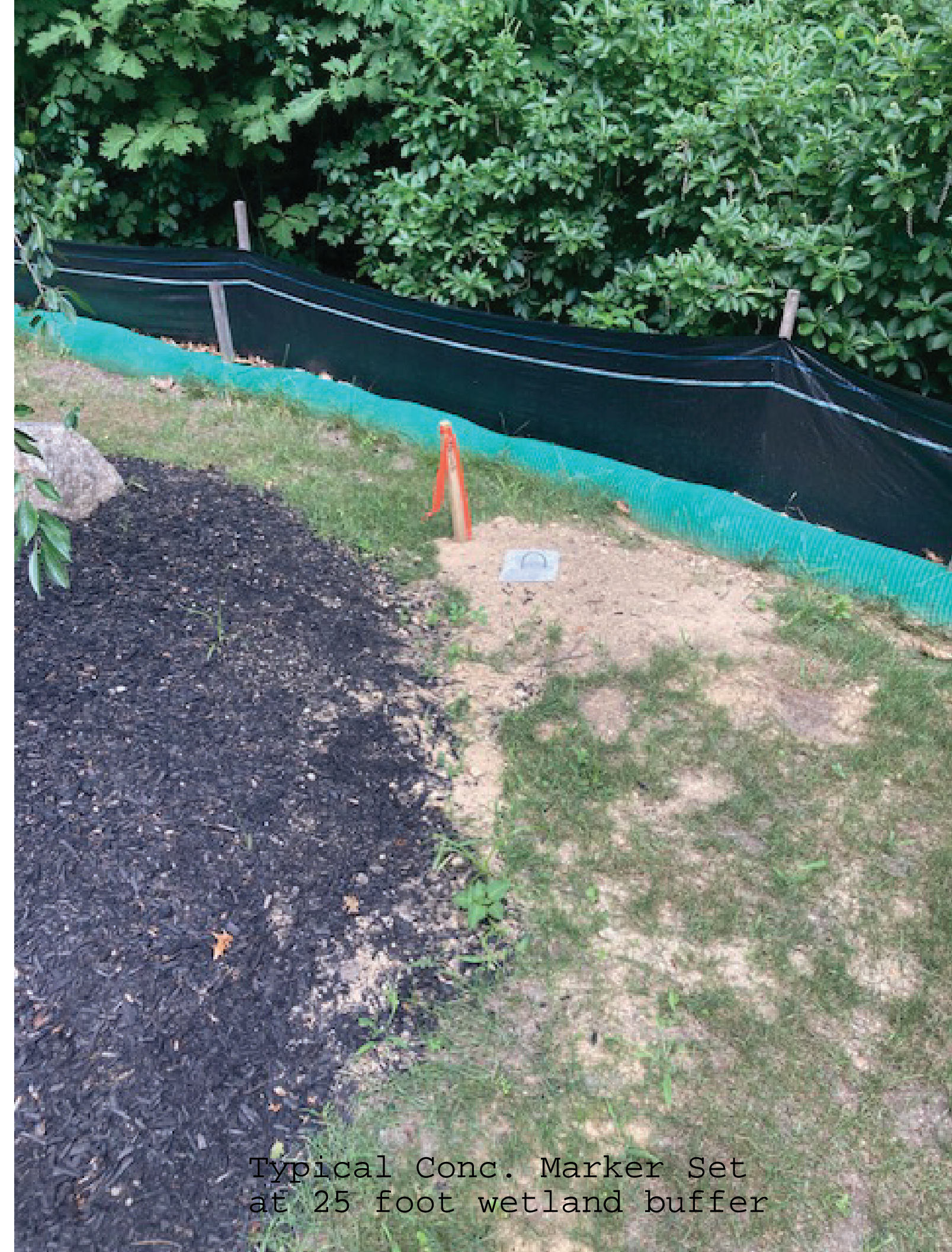
Typical Conc. Marker Set at 25 foot wetland buffer