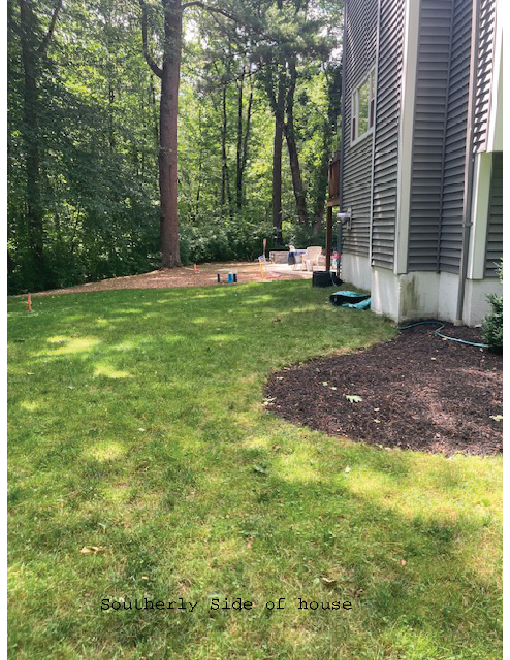
Southerly Side of house