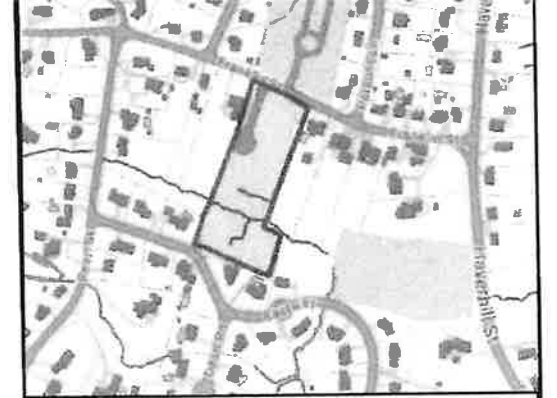
LOCUS MAP NOT TO SCALE

ASSESSOR'S REFERENCE 052.000-0000-0025.0