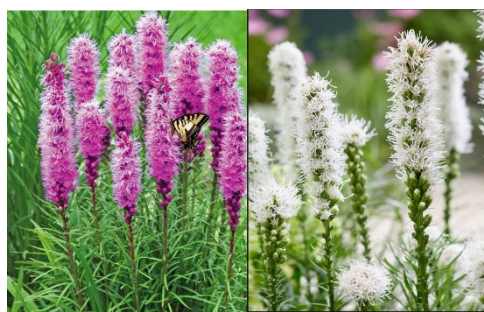
Herbaceous: Liatris spicata (Gay Feather)