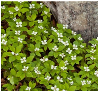
Ground Cover: Chamaepericlymenum canadense (Bunchberry)