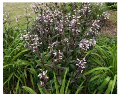
Herbaceous: Penstemon digitalis (Beard Tongue)