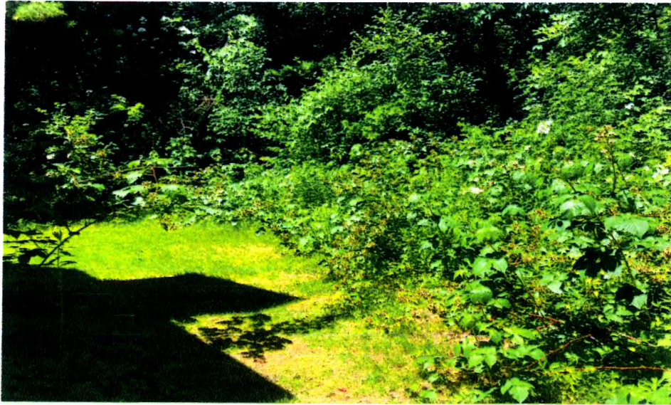
Restored Area behind 22 Small Lane.