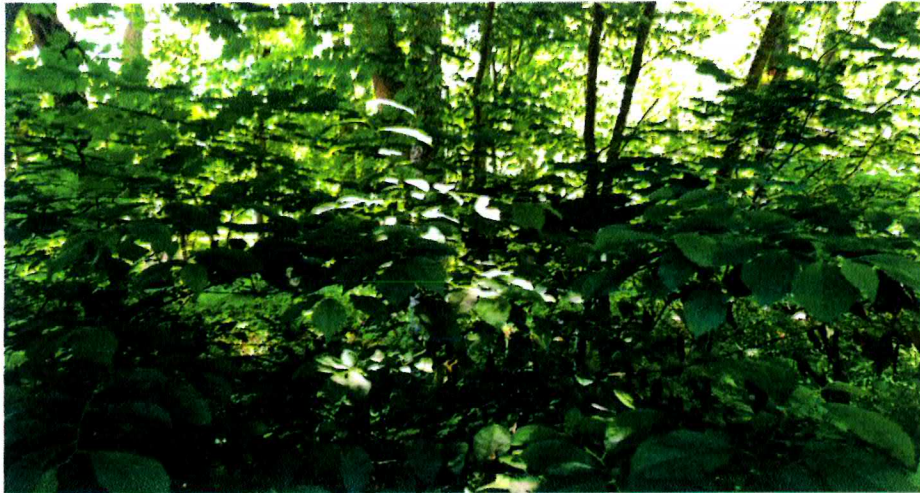
Restored Area behind the pool fence at 18 Small Lane.