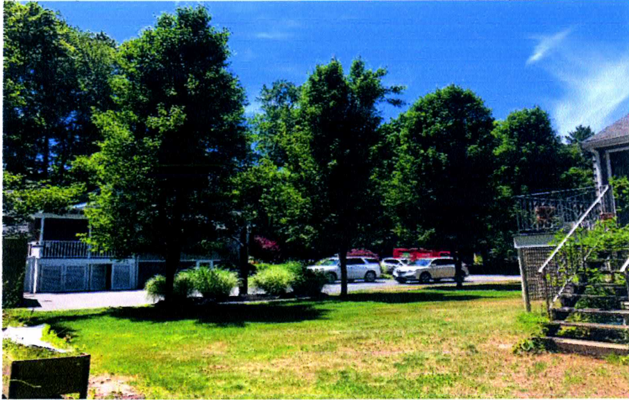
(5) Bradford Pear Trees